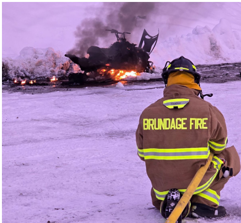
Members of the Brundage Mountain Fire Protection Agency respond to a snowmobile fire in the West Face Trailhead parking lot (Nov. 2024).

The creation of the new Brundage Fire Protection Association and EMS agencies provide several community benefits. Rather than compete for the limited fire and EMS services in the broader community, the creation of the independent Brundage Fire Protection Association and Brundage EMS boosts regional emergency response capabilities. Through mutual aid agreements, fire departments and EMS agencies coordinate efforts to ensure quick and effective responses to fires, medical crises, and other incidents, even outside an agency's immediate service areas.